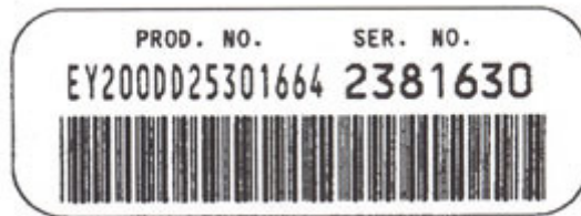
[Example of Product Number]

All Robin 4 cycle engines have a Product number label similar to the label illustrated below.